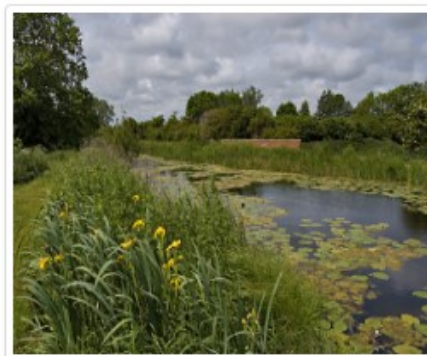
The brick parapet visible in the centre of the picture is where the Leven Canal crosses over the Burshill and Barff Drain.

In memory of 3 of our founding PPG members who sadly passed away during the pandemic