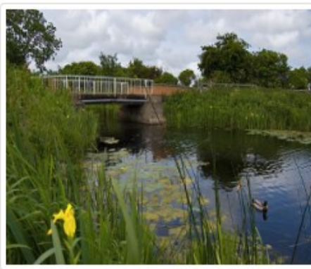
Sandholme Bridge Leven